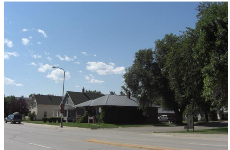
West Side of North Main Near Taylor School

Develop an appealing, consistently maintained North gateway corridor into Sheridan, accommodating safe multi-modal travel. Enhance livability and business opportunities for the North Main neighborhood through improved transportation and parking alternatives.