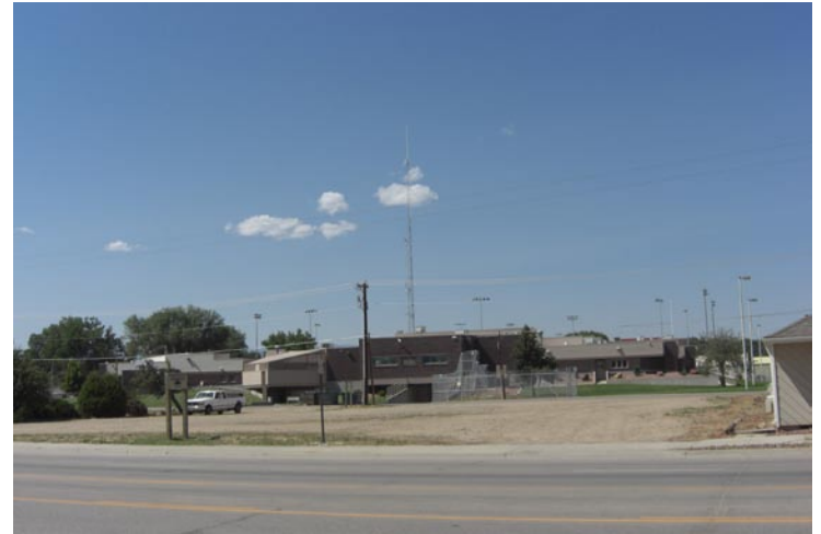
Sheridan County Jail - North Main Street

The county jail on North Main is perceived to detract from the safety and marketability of the North Main area. To facilitate revitalization of the North Main area, Sheridan County should evaluate long-term possibilities for relocating the county jail. The County should evaluate the possibility of converting the existing building into courtroom facilities with associated short-term (24-48 hour) detention of inmates. In addition, given the high visibility of the property and interrelationship with the county jail issue, Sheridan County should work with North Main residents and business owners to develop plans for reuse of the adjacent property that it recently acquired from Kentucky Fried Chicken.