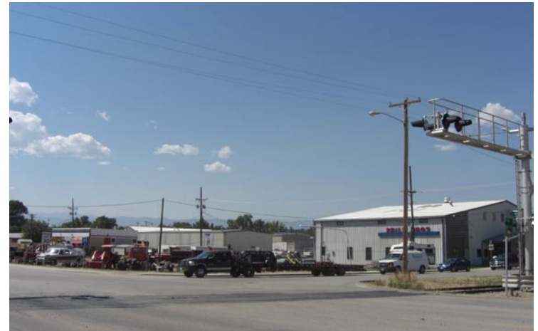
Intersection of North Main and Fort Road

On October 2, 2008, members of the NMRI Steering Committee met with representatives of WYDOT to talk about both the aesthetic elements of the first phase of the North Main project and also to talk about alignment and safety of the Fort Road intersection. WYDOT and the NMRI Steering Committee discussed the potential for a stop light at Fort Road as well as the potential for stop lights or pedestrian crossing lights at 11th Street and 8th Street. In that meeting, WYDOT committed to work with NMRI Steering Committee to shape the aesthetic elements of the WYDOT project and also agreed to examine the traffic issues raised by the NMRI.