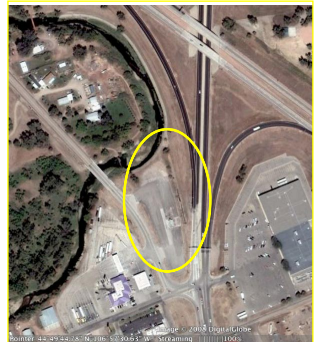
Former WYDOT Port of Entry

In the coming years, the WYDOT North Main project will help beautify the North Main corridor through installation of new lighting, trees, and other enhancements (see Element #1 above). In the immediate future, we can begin beautifying the North Main corridor by creating an incentive program to encourage private landowners to undertake landscaping and