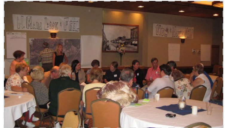
Look and Feel Work Group at the North Main Summit

This report contains the vision statements and action plans developed by the NMRI working groups and by the North Main Steering Committee - a nine-member board representing each of the NMRI working groups.